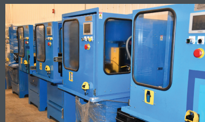
2100 Series Up to 0.75" Ø end finishing Electric & Hydraulic